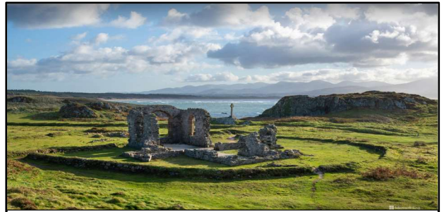
Ruins of Sr. Dwynwen's Church on Ynys Llanddwyn

never marry, Her wishes were granted and she founded a convent on the island where she devoted herself to God's service the rest of her life. A well there was named after her. It became a place of pilgrimage after she died around 465. (historic-uk.com et al)