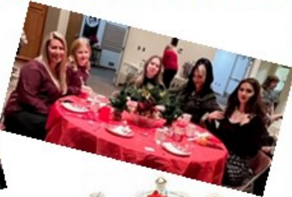
Advent Tea 2023