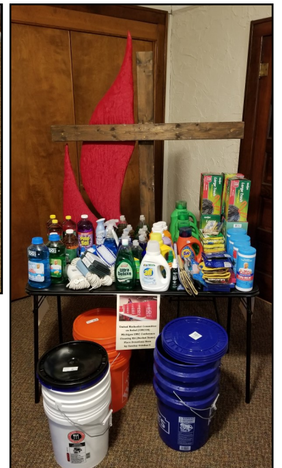
Thanks abound. (above left): Pastor gives thanks to all those who were involved in the surprise birthday cake and song at coffee hour on October 2. (above center and right): A big thanks to all who participated in the Michigan Conference Disaster Response Flood bucket drive to replenish cleaning kits in our United Methodist Committee on Relief warehouse that supplies these kits for use in American disasters.