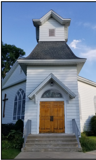
The front entryway to the church is being refinished.