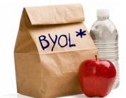
*Bring your own lunch!

(Coffee hour snacks will still be available if you forget)