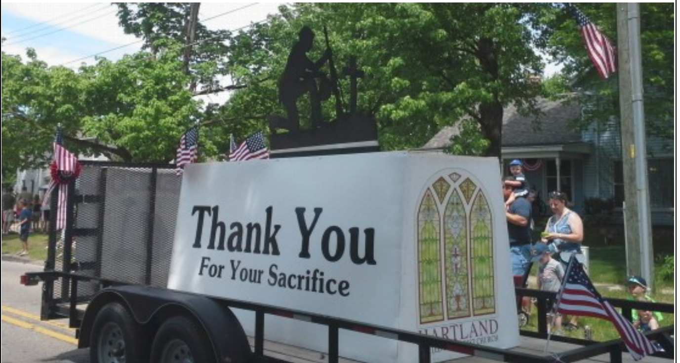
Our Memorial Day, 2014 Float