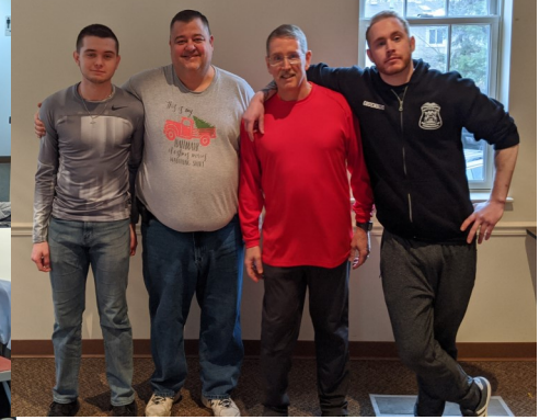
Second & First Place Teams