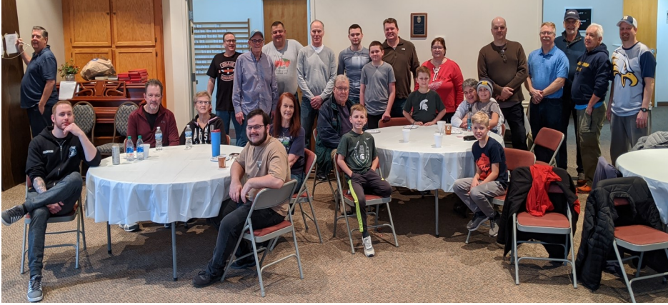
2020 Corn Hole Tournament Teams